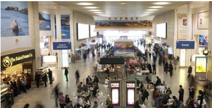
ExCeL is a very busy exhibition & conference centre

Installation was another area where Zeag impressed. "Facing a ridiculous target, everyone at Zeag worked really hard to make sure everything happened on time. No empty promises – they met all the deadlines and were really on the ball. I found a fault at 8:30 in